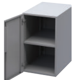
Single Storage Module with Locking Doors