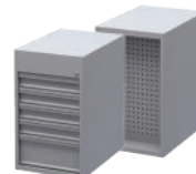
Tool Storage Module