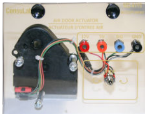
MD-4115 (53208) (SHOWN)