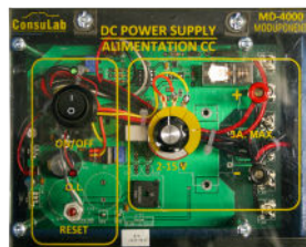
MD-4000 (53061) (SHOWN)