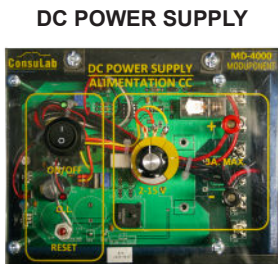
MD-4000 (53061) (SHOWN)