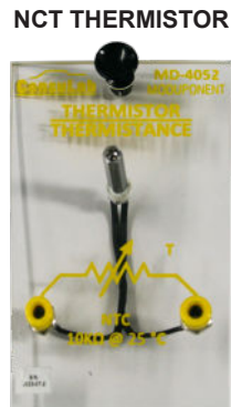
MD-4052 (53067) (SHOWN)