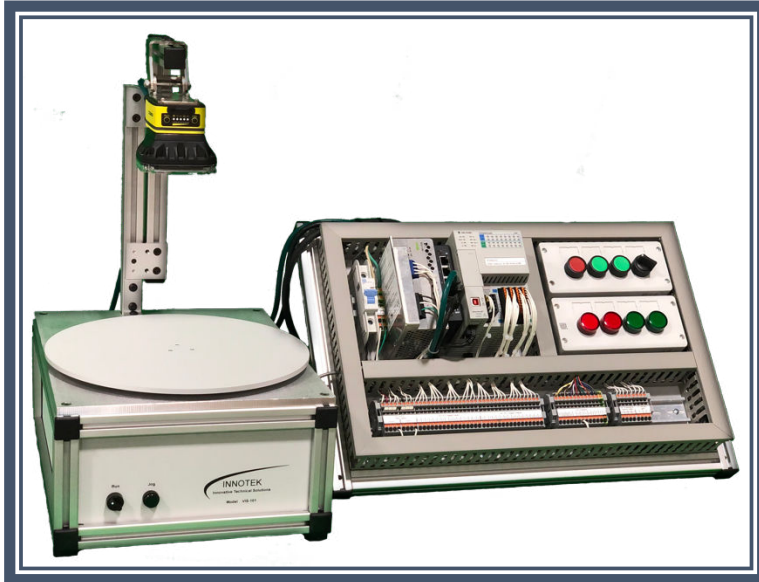
Model Shown with Cognex Insight 7000 and CompactLogix

The Vision Training System provides a hardware solution that introduces the fundamentals of artificial vision. The unit provides components that are used in industrial applications, allowing participants to perform experiments in camera installation, electrical connections, and configuration of vision jobs via software.